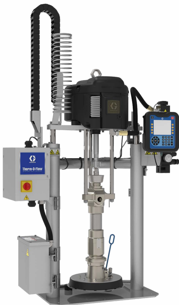
Therm-O-Flow Warm Melt 20 L (5 gal)