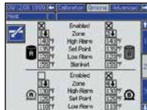
Set-up screen gives users easy access heat options