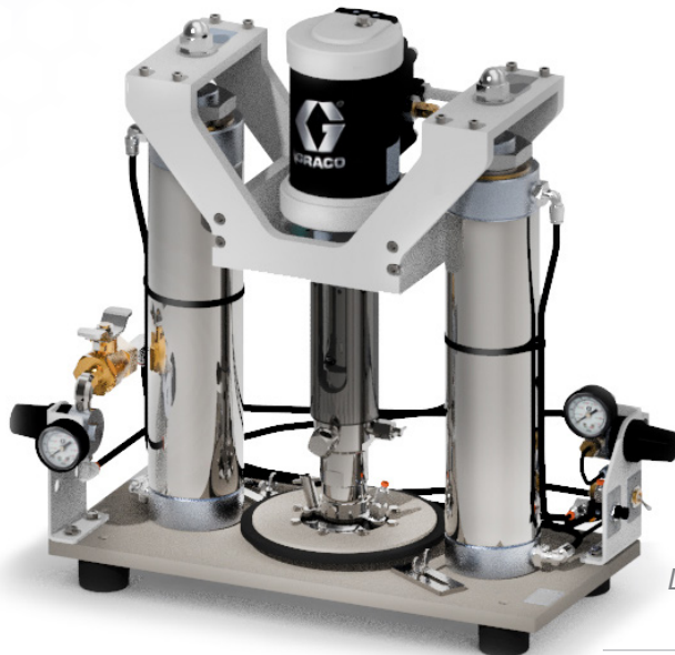
DynaMite 190 HD with Wiper Plate

The DynaMite 190 is ideal for pumping low to medium viscosity materials. For applications using high viscosity or highly abrasive materials, use the heavy duty DynaMite 190 HD.